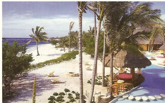
PRIVATE BEACH. Go for a swim and enjoy the peaceful ocean breeze.

Palmasola is made up of two residences "The Master Residence" and the "Guest Residence" in a village like setting you can rent for a week, which consists of seven suites. The heart of the villa is the pool deck, where you can relax, have drinks, and swim in the 200 foot-long pool. Live all the luxury you have always dreamed of, where you can savor world class cuisine, play golf in a Jack Nicklaus Signature Golf Course and let yourself be pampered by a full time staff of nine people surrounded by an enchanting beach.