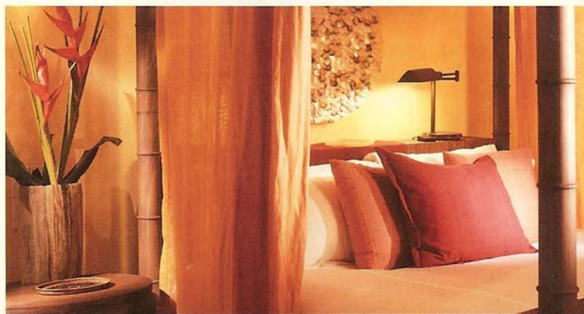
LUXURY. Relax around all the accommodations you can have in the privacy of your bedroom..